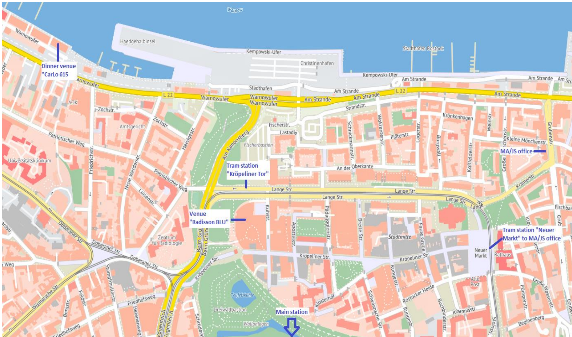
Kartenbild © Hansestadt Rostock (CC BY 4.0) | Kartendaten © OpenStreetMap (ODbL) und LKfS-MV